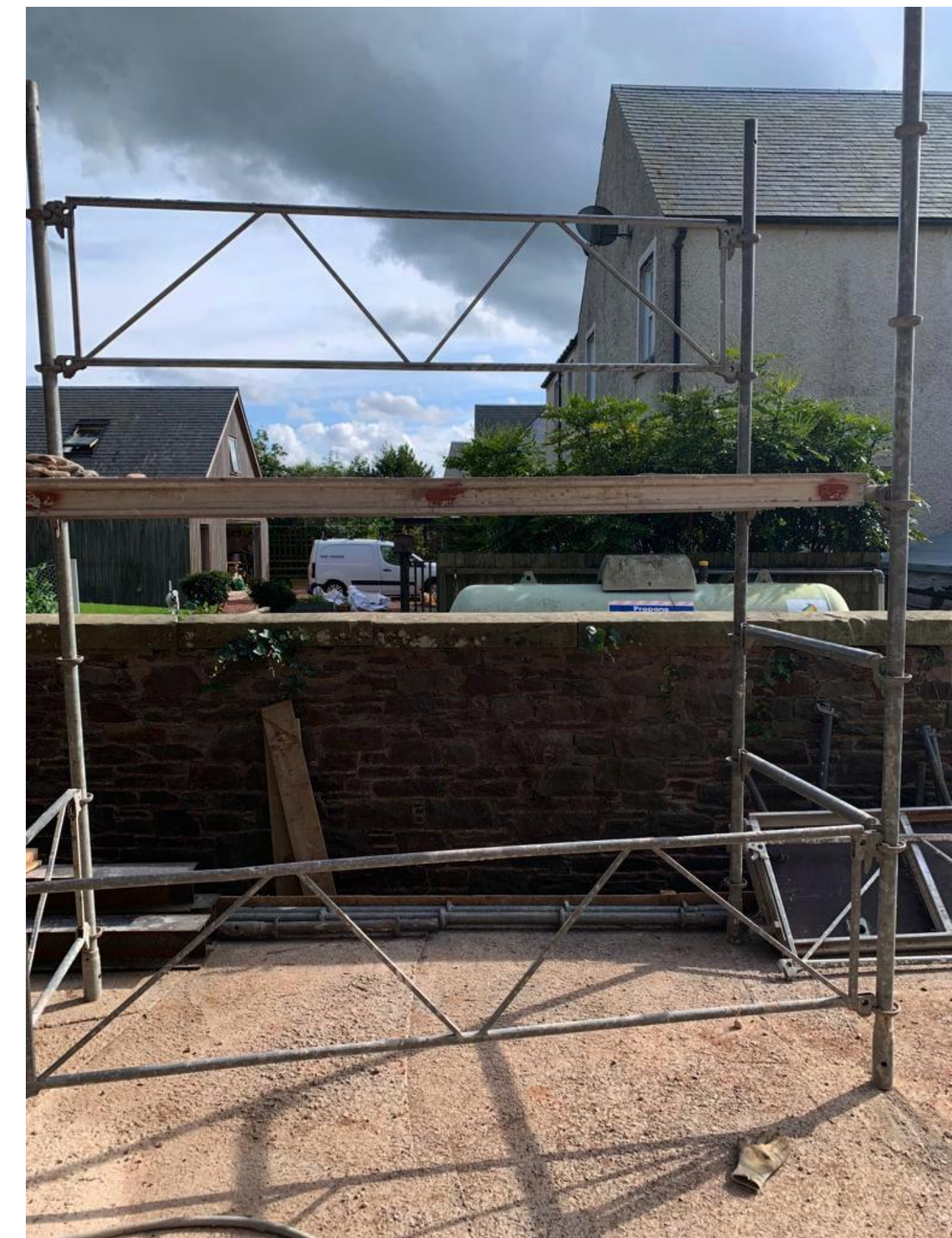
View over boundary wall. Note obstructions - existing gas tank, trees and fencing screen.